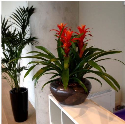
Guzmania Display - £50.00

I hope you have enjoyed looking through the images in our Brochure. Please do get in touch for a quote!