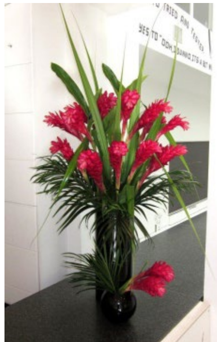
£100.00 Combination of Vases