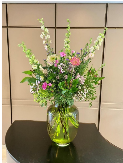
£40.00 Summer Garden

It is also important for our customers to decide on which style they would like for their reception area.