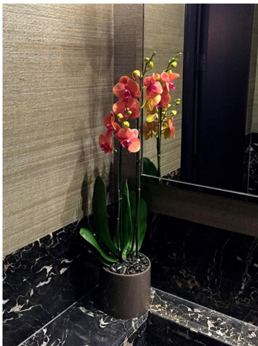
Peachy Pinks £40.00