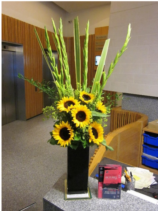
£50.00 Sunflowers & Green Gladioli