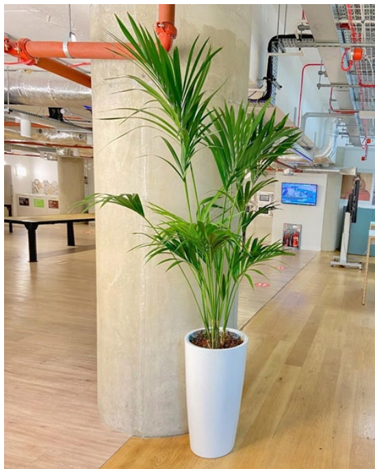
£220 Kentia Palm