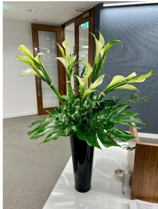
£75.00 All Round Contemporary