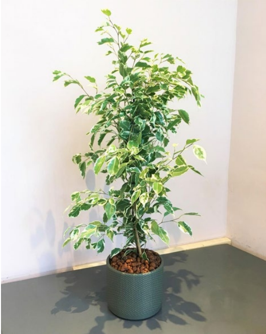
£20 Ficus Benjamina