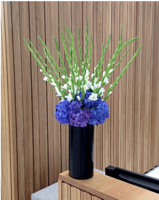
£75.00 All Round Vase