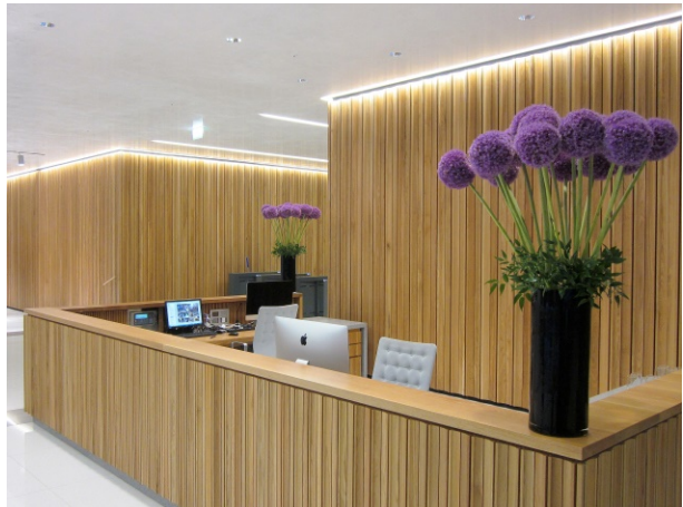
Pair of £75.00 Vases

Flowers By Flourish Ltd Unit 22 Newington Industrial Estate 87 Crampton Street London SE17 3AZ Registered No: 5979767 England VAT No: 918 6876 69 TEL: +44 (0) 20 7701 4272 FAX: +44 (0) 20 7703 4799 www.flowersbyflourish.com