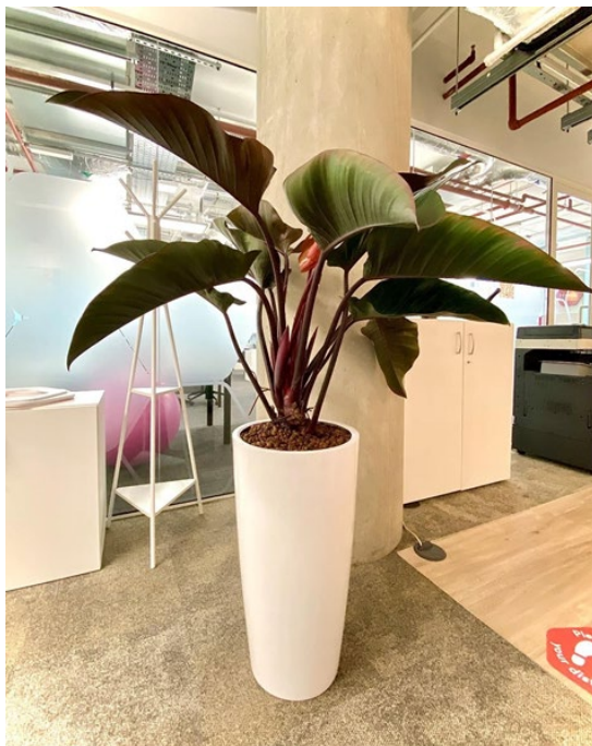
£260 Philodendron 'Imperial Red'