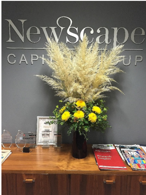
£50.00 Autumnal Grasses