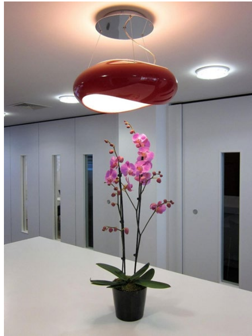
£40.00 – Double Stem Orchid