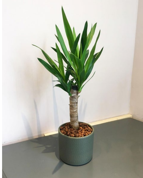
£20 Yucca plant