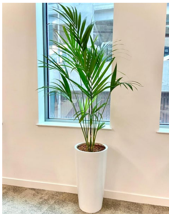
£220 Kentia Palm