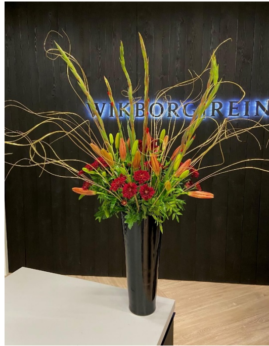
£50.00 Red Lilies & Gladioli