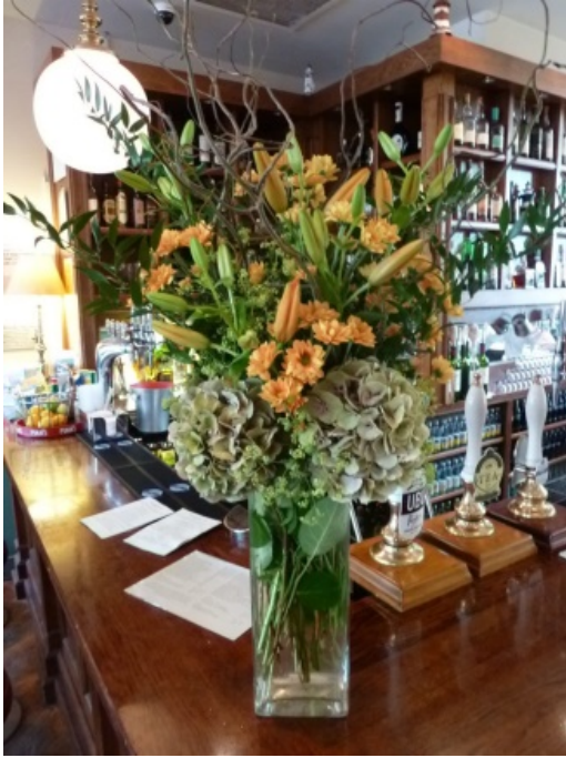
£50 Autumnal Pub Vase

We also supply Vases to Restaurants & Pubs all over central London.