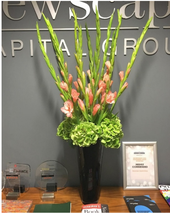
£50.00 Hydrangea & Gladioli