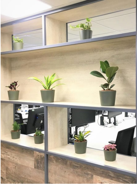
From £7.50 Various small plants