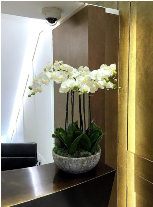
£120.00 – 4 Plants