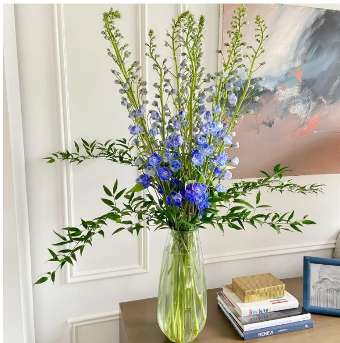
£50.00 Summer Delphiniums