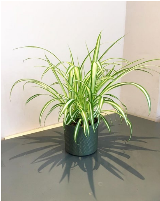
£20 Chlorophytum (Spider Plant)