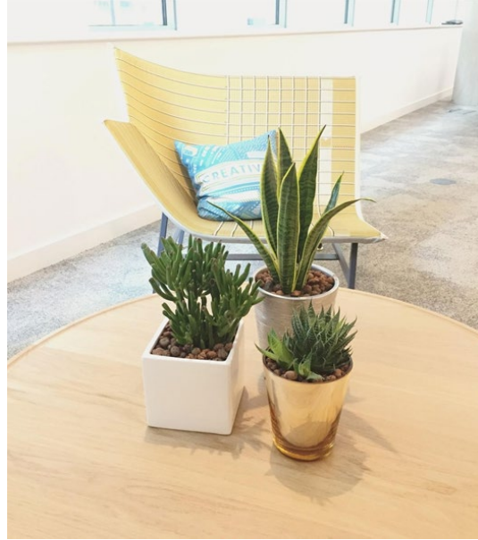
£45 Trio (Sansevieria, Crassula, Aloe)