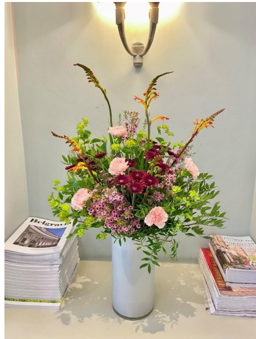
£40.00 Garden Traditional Mix