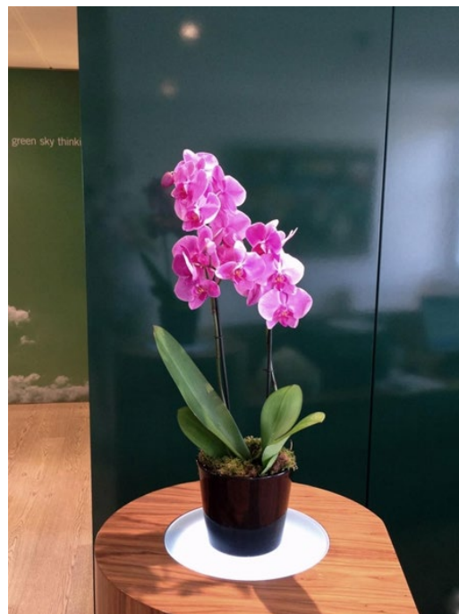
Pink Double Stem £40.00