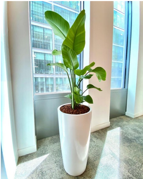
£240 Floor standing Strelitzia

Below are some examples of plants in offices which we supply.