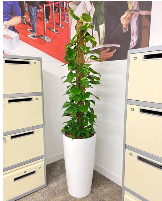
£210 Floor standing Epipremnum

Our larger planters are produced to order by a company here in the UK. Made from GRP, they are lightweight and durable. They come in a huge variety of shapes, sizes, colours, and finishes. They can even replicate natural materials such as stone, concrete, terracotta, and metals.