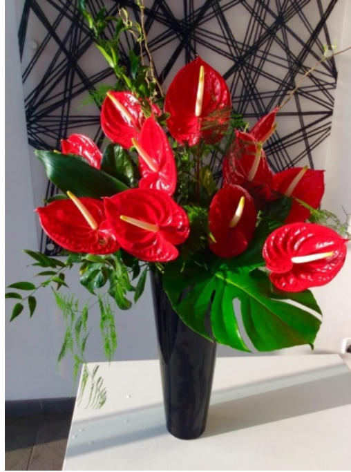
£50 Tropical Restaurant Vase